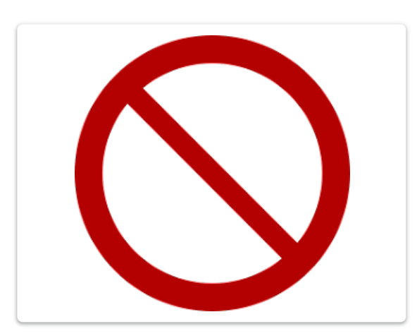
No computing device(s) requested.